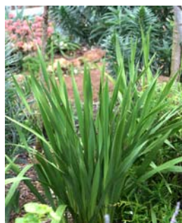
Watsonia sprouts, leaves, and flower.